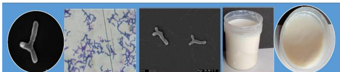
Figure: Pictorial representation of native isolate of probiotic bifidobacteria and the fermented product developed as a part of translational research.